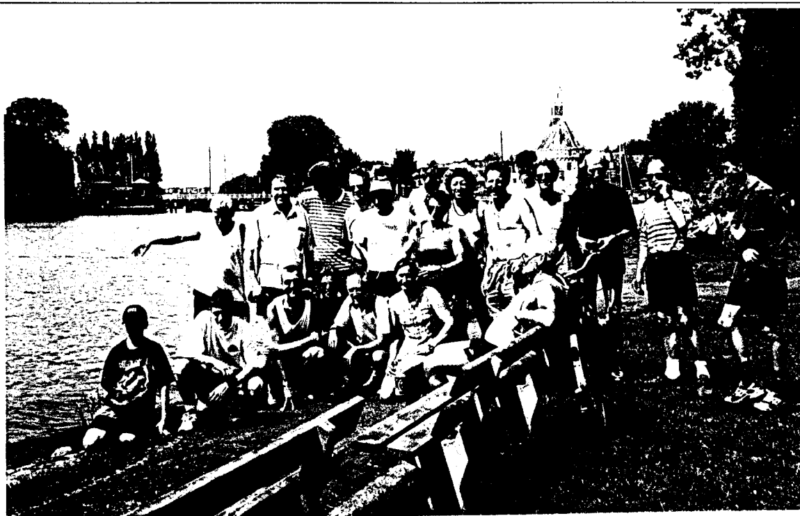
The intrepid adventurers stop at a small lake before devouring lunch in De Hoofdtoren Restaurant in the old town of Hoorn. A relay run takes place around the small lake; the record of which is 21 hours!!

Pressing on north we reached Amsterdam and finally arriving at the athletics' track in Hoorn around 8 o'clock. At the entrance we were greeted by a large group of happy smiling faces who gave us a well needed cup of coffee and offered to take our bags, wallets and watches etc. We were later taken to a Chinese restaurant where we all enjoyed a fantastic meal, washed down with glasses of Dutch lager. The evening closed with us all going home with our respective hosts and a welcoming bed.